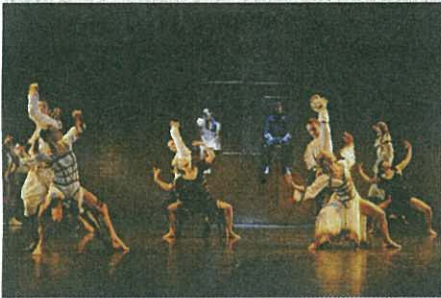
TODAY (SEPT 19) MODERN BALLET "SNOW WHITE"

Snow White is back like we have never seen her before in a sensational, unconventional modern ballet by French choreographer Angelin Preljocaj, who reinvents the amazingly popular character. This sensual version takes on Grimm brothers' eternal story, shows us that the world of symbols belongs as much to the children as to the grownups.