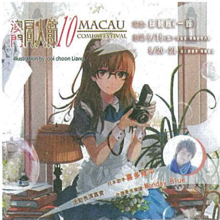
10TH MACAU COMIC FESTIVAL

TIME: 8pm DATE: September 19-20, 2014 VENUE: Macau Cultural Centre ADMISSION: MOP150, MOP200, MOP250, MOP300 ENQUIRIES: (853) 2870 0699 ORGANIZERS: Macau Cultural Centre http://www.ccm.gov.mo